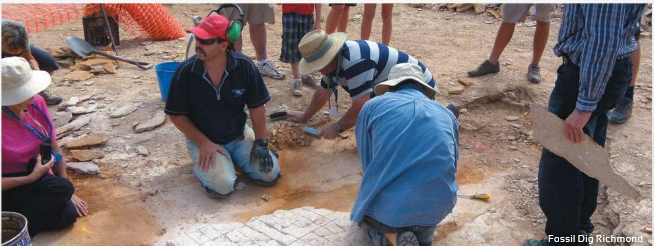
Fossil Dig Richmond