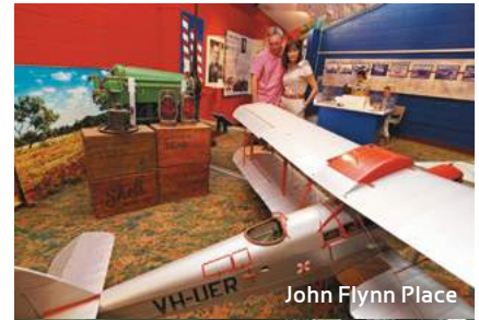
John Flynn Place

Accommodation: Isa Youth Camp, Lake Moondarra, Mount Isa. Ph: (07) 4743 9881