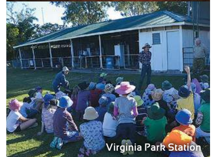
Virginia Park Station