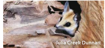
Julia Creek Dunnart

Highlights: Kronosaurus Korner Bush Tucker Garden at Lake Fred Tritton Julia Creek Orientation activity Evening Star Gazing activities