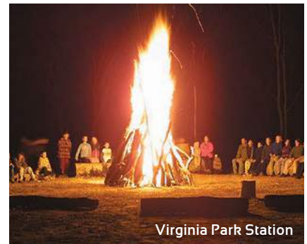
Virginia Park Station